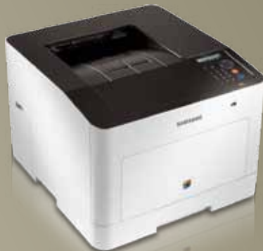
Control Panel Functions